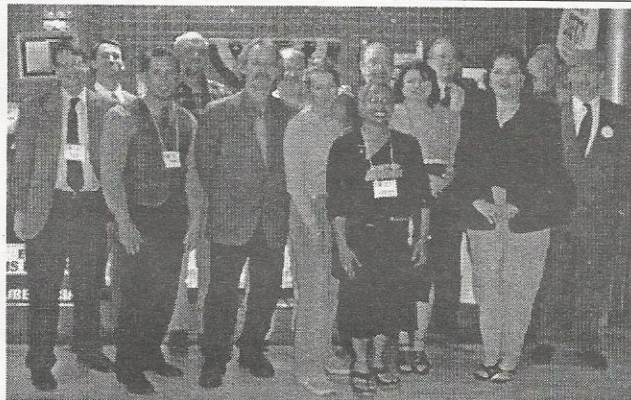
The New Board and Committee Members